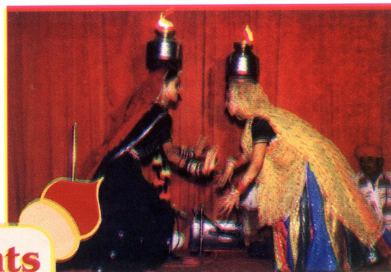
Rajasthani Folk Dance

A two-day weekend food festival 'Jeeman' was organised at the Garden Hotel on 5th & 6th June, 2004. The main feature