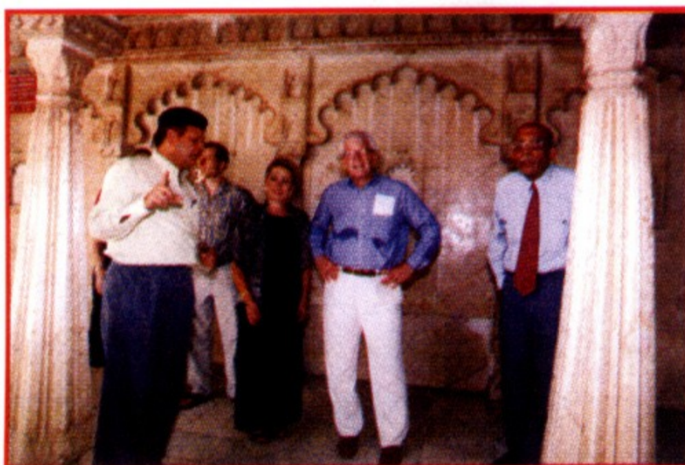
US Ambassador to India, His Excellency David C Mulford at The City Palace Museum