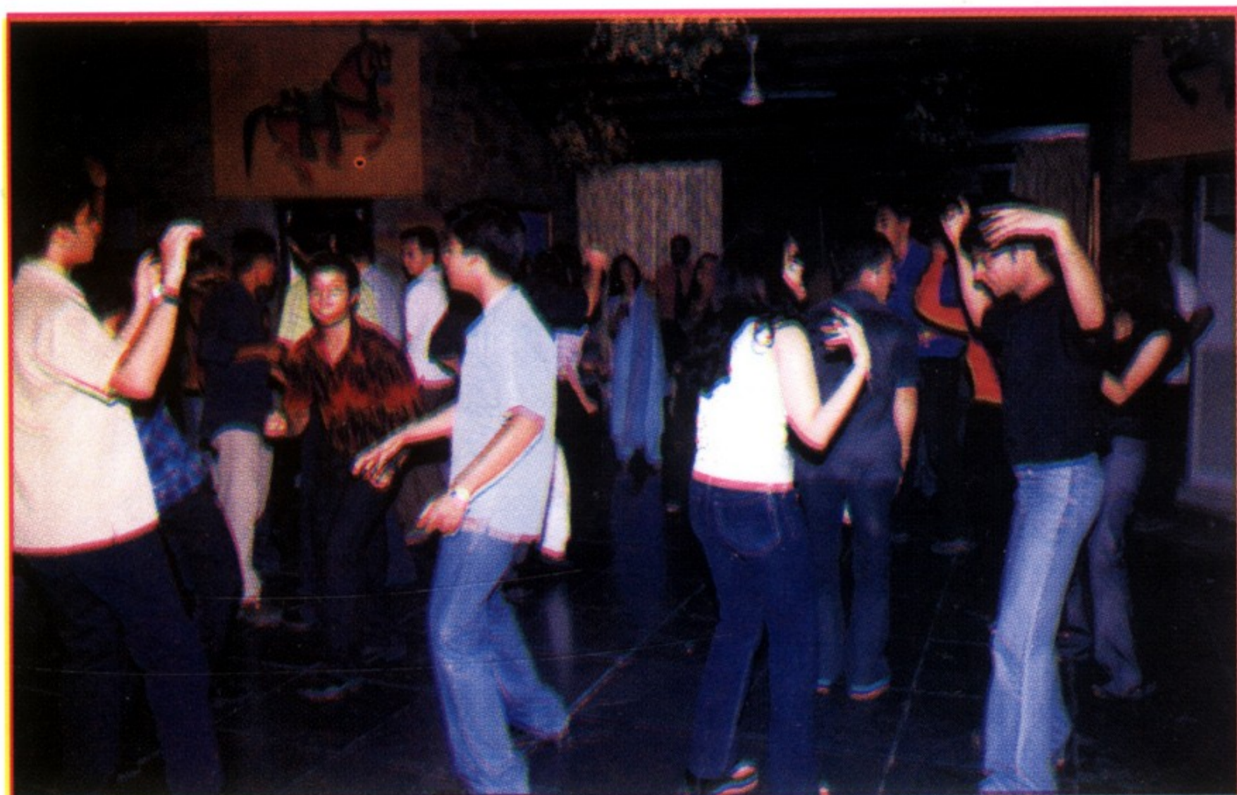
Dance Your Blues Away

A two-day event filled with food, fun and froth was organised at Shikarbadi Hotel, on 10th & 11th July, 2004. A groovy dance floor was specially made for the event and a live DJ created the perfect ambience for non-stop dancing & masti.