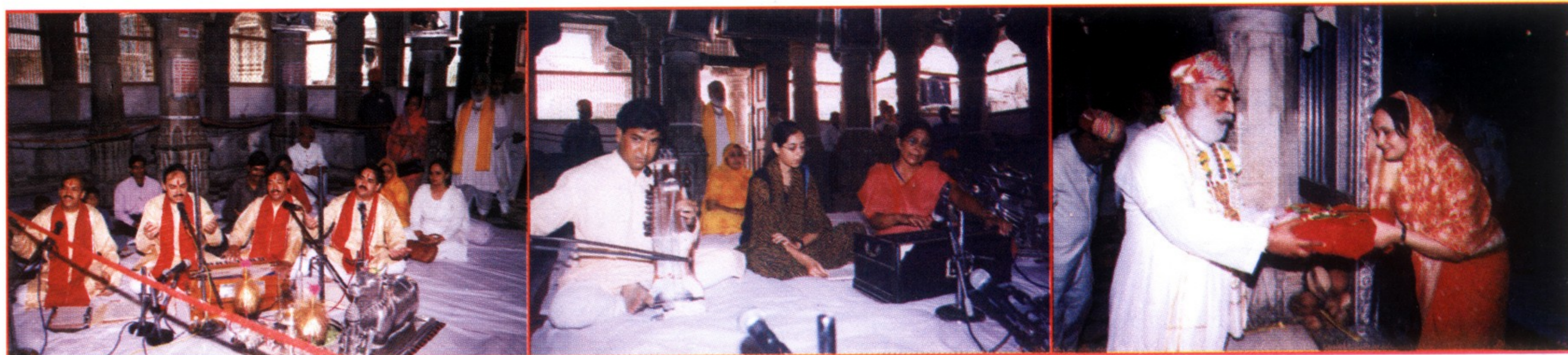
Various Artists Performing at Shri Eklingji

The statue of Shri Eklingnathji decked out in a white dress with white flowers and white ornaments, presented an enchanting vision. Hundreds of devotees patiently waited in queues, for their turn to have darshan of the captivating and charming idol of the deity.