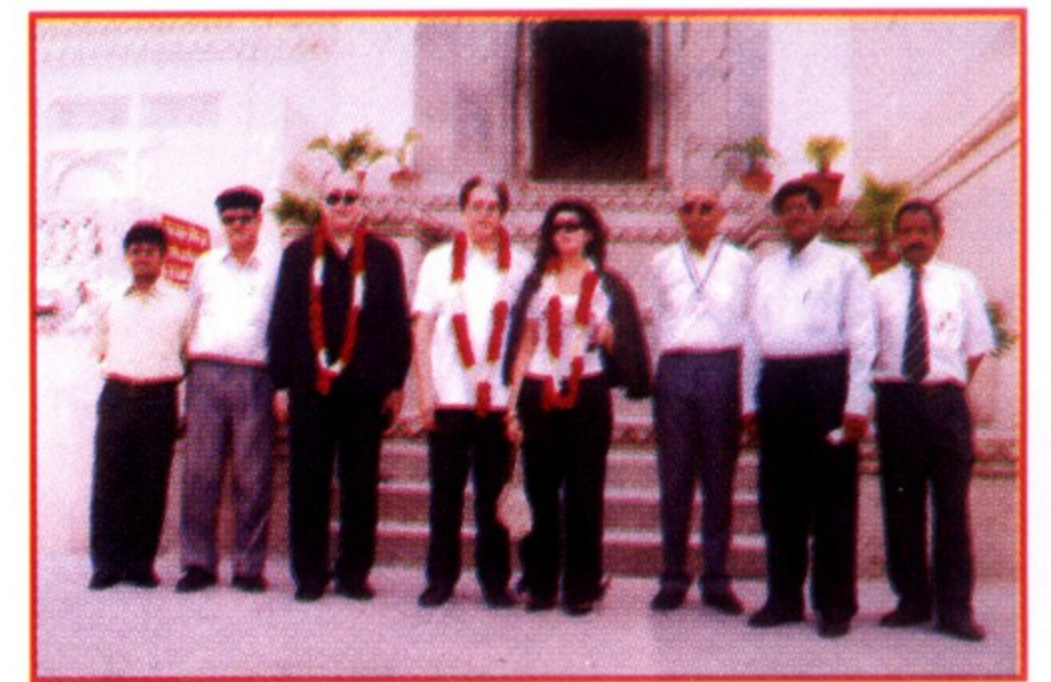
Minister of Tourism and Handicrafts of the Republic of Tunisia at The City Palace Museum

The dignitaries were accorded a traditional Mewari welcome. In the visitors book of the museum, the Minister wrote that he was very pleased to visit this historic museum and was very impressed with its architecture, ancient miniature paintings and it's upkeep.