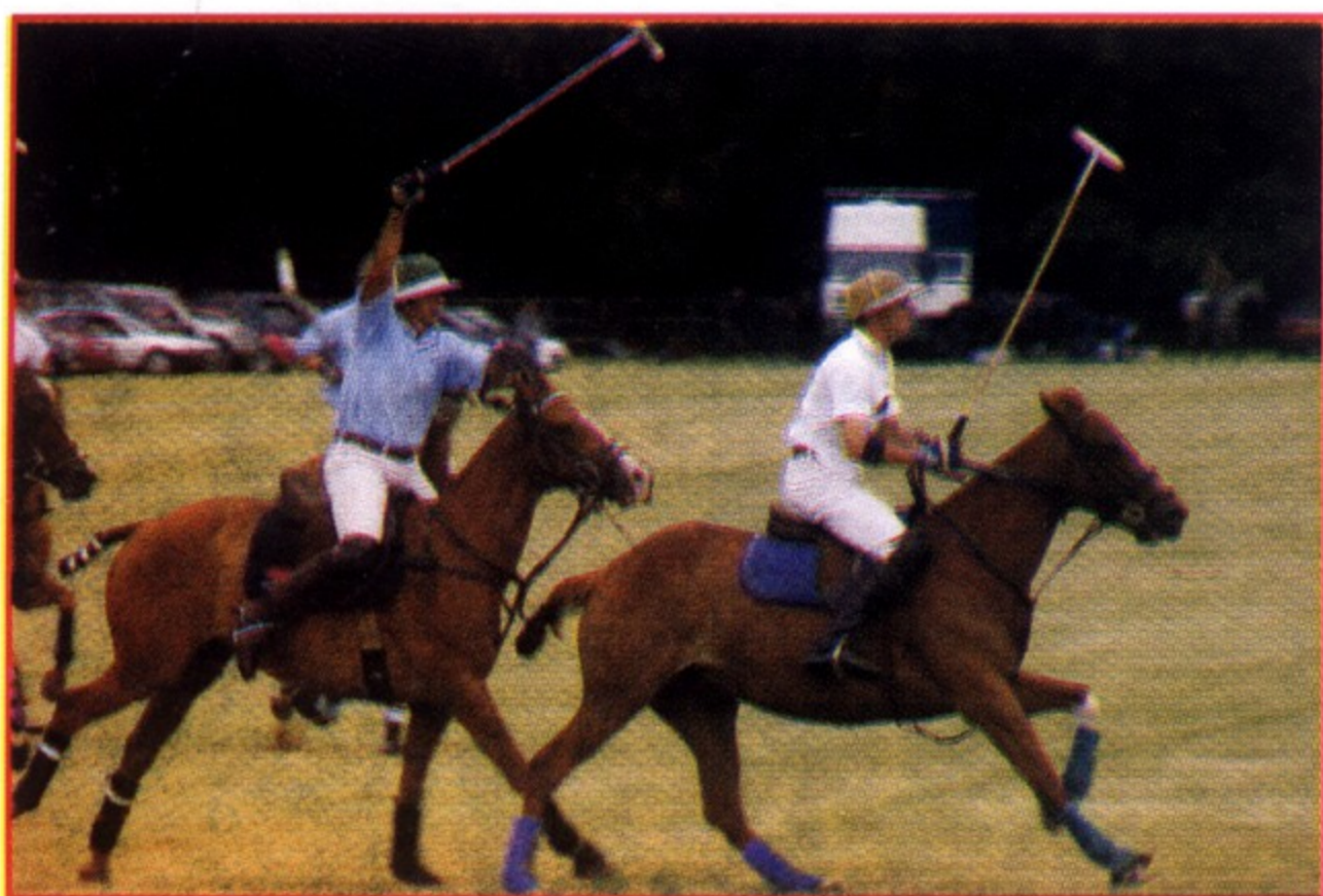
Polo Action at The National Stud at Newmarket

The match was followed by a prize distribution ceremony and dinner in a marquee on the grounds.