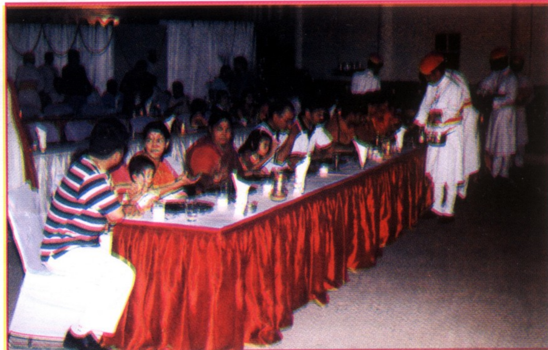
Dinner being served at Jeeman