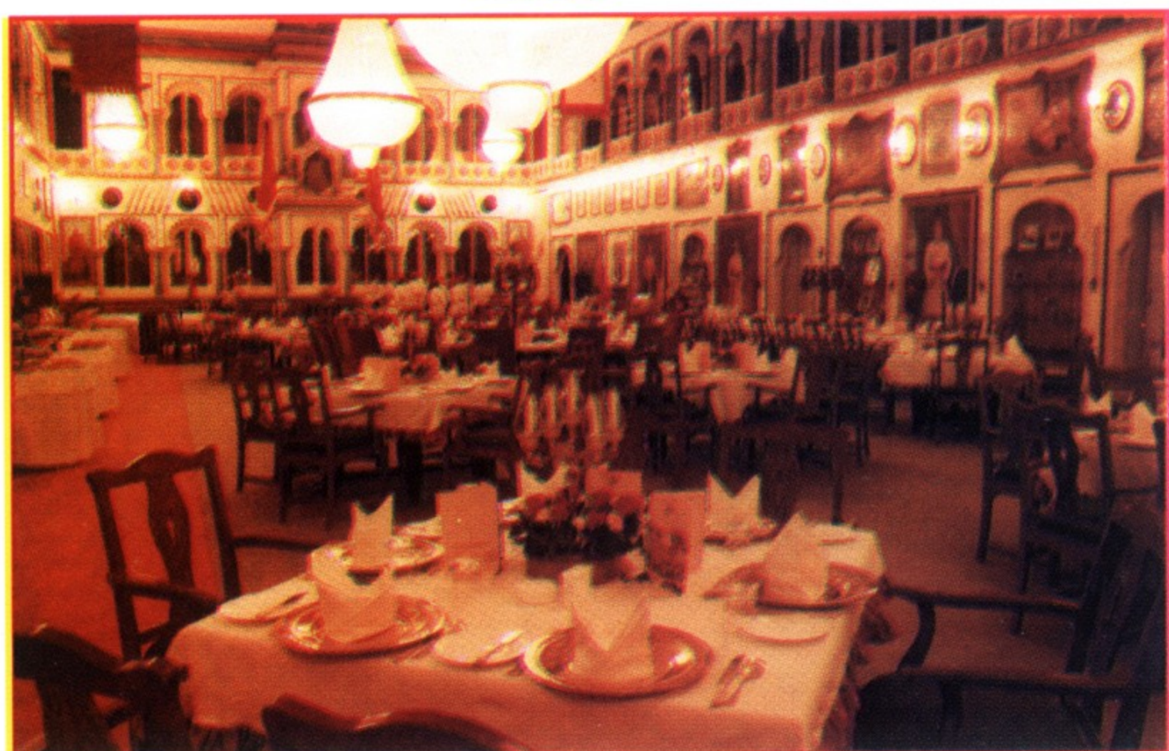
The Grand Durbar Hall

A special dinner for the Stanford Business School Group was held at The Durbar Hall, on 30th June, 2004. Starting with the traditional red carpet welcome to the Stanfordinians, the hotel foyer was decorated with flowers and customary floor painting, to give the guests a glimpses of rich Indian culture. Traditional Indian candle stands lit the entryway and fragrant rose petals lay gently underfoot. The majestic Durbar Hall left the Group wonder-struck with its historic grandeur, as it presented the perfect venue to host this lavish banquet. Traditional Mewari entertainment-a puppet show and live sitar and tabla performance, during the dinner, made the evening a special and an unforgettable experience for the Group.