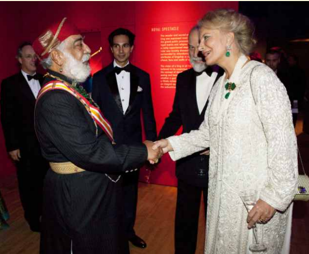
Shriji Arvind Singh Mewar of Udaipur greeting HRH Princess Michael of Kent