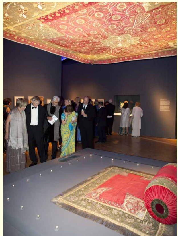
Gaddi, Udaipur 1850 - 1900