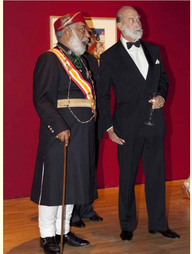
Shriji Arvind Singh Mewar of Udaipur with HRH Prince Michael of Kent GCVO