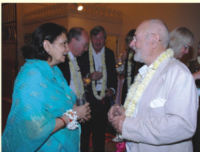
Smt. Vijayaraj Kumari Mewar of Udaipur with participants of Rolls-Royce Royal Tour of Rajasthan at the Garden Hotel, Udaipur