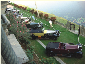
Vintage Cars from the Rolls-Royce Royal Tour of Rajasthan parked at Dungarpur