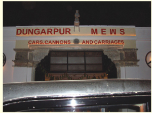
Newly inaugurated Dungarpur Mews Cars, Cannons and Carriages at Dungarpur