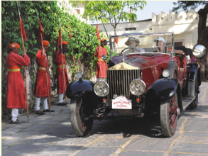
One of the vintage cars of Rolls-Royce Royal Tour of Rajasthan en route towards Dungarpur from Shiv Niwas Palace, Udaipur