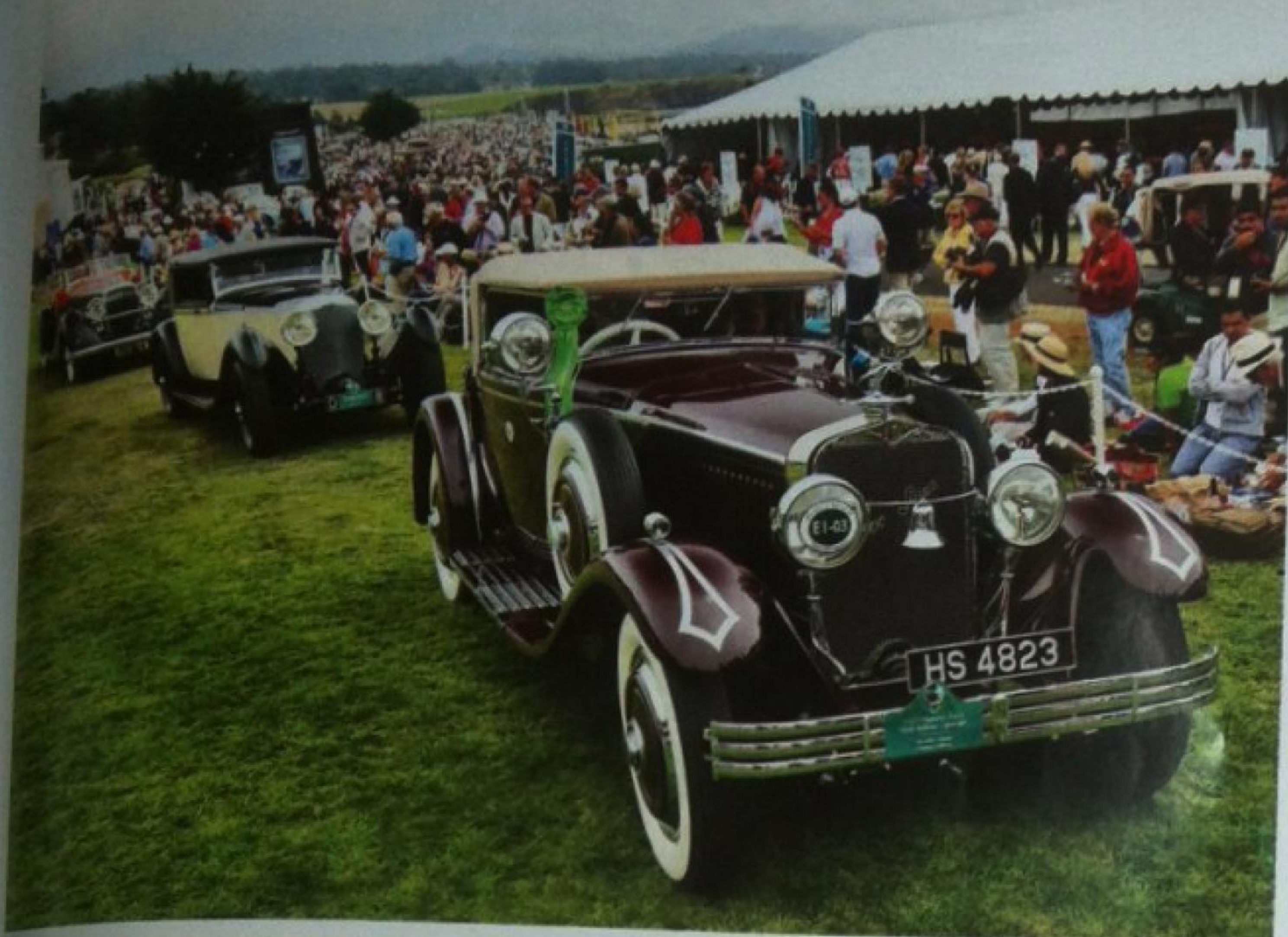
MAHARAJA MAGNIFICENCE ON THE MOVE! Not since the Delhi Durbar could one have seen so many exotic high brow vehicles with strong Indian provenance ever got together in their original finery as they did at Pebble Beach 2012. The pic shows three of the top runners rolling down the greens with the ex-Maharaja of Alwar's 1925 Hispano-Suiza H6B with Kellner cabriolet coachwork leading the ex-Maharaja of Jaipur's 1930 Bentley Speed Six Mulliner saloon with the ex-Maharaja Holkar of Indore's Duesenberg Model J Gurney Nutting Speedster next up.