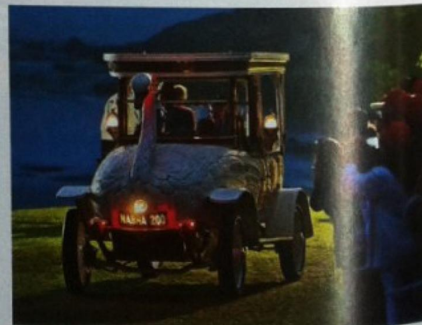
FROM A MIDSUMMER NIGHT'S DREAM! Fantastic shot of the 1910 Brooke Swan car as she purrs her way on the greens in the early hours of judging day. Pebble Beach doesn't repeat cars and if so in exceptional cases only. This was the Swan's second coming at this event, the first being in 1993 when she took the Lord Montagu Award.