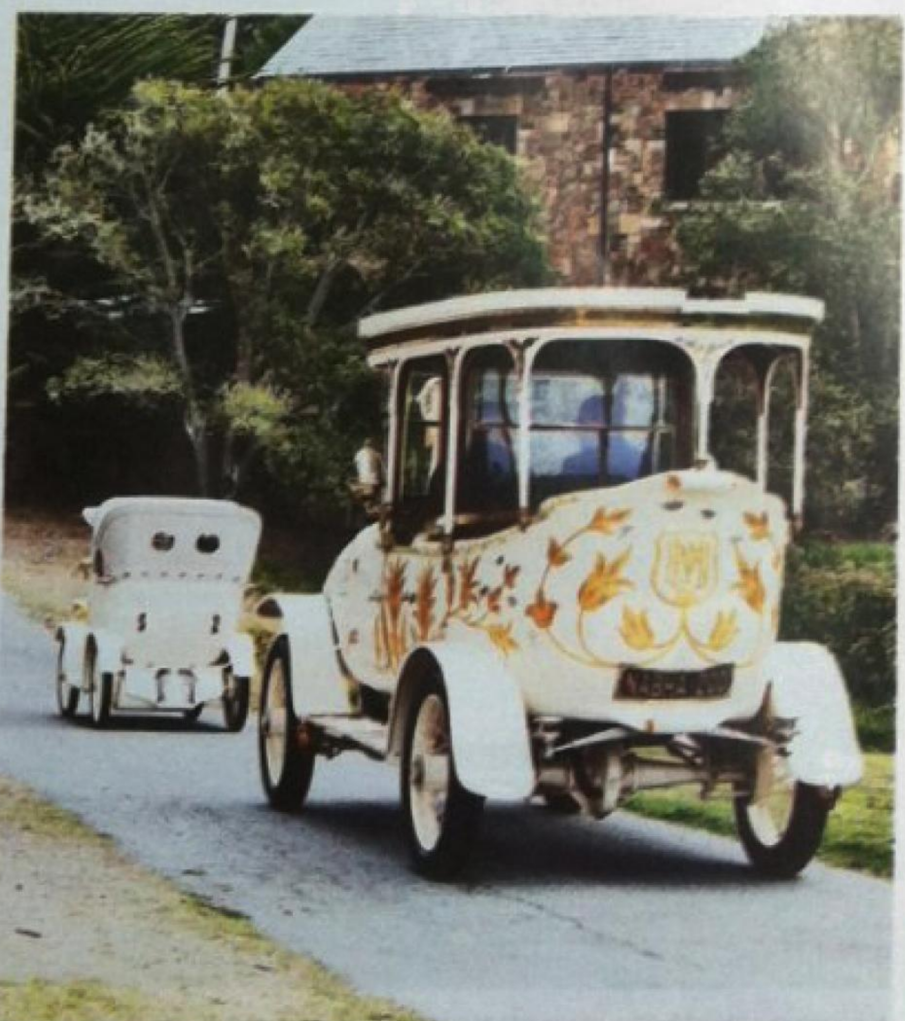
ECCENTRIC ENTITIES! The 1910 Brooke Swan car with the electrically-propelled 1919 Cygnet which once graced the Maharaja of Nabha's fleet. Both cars are now in the Louman Museum in Holland.