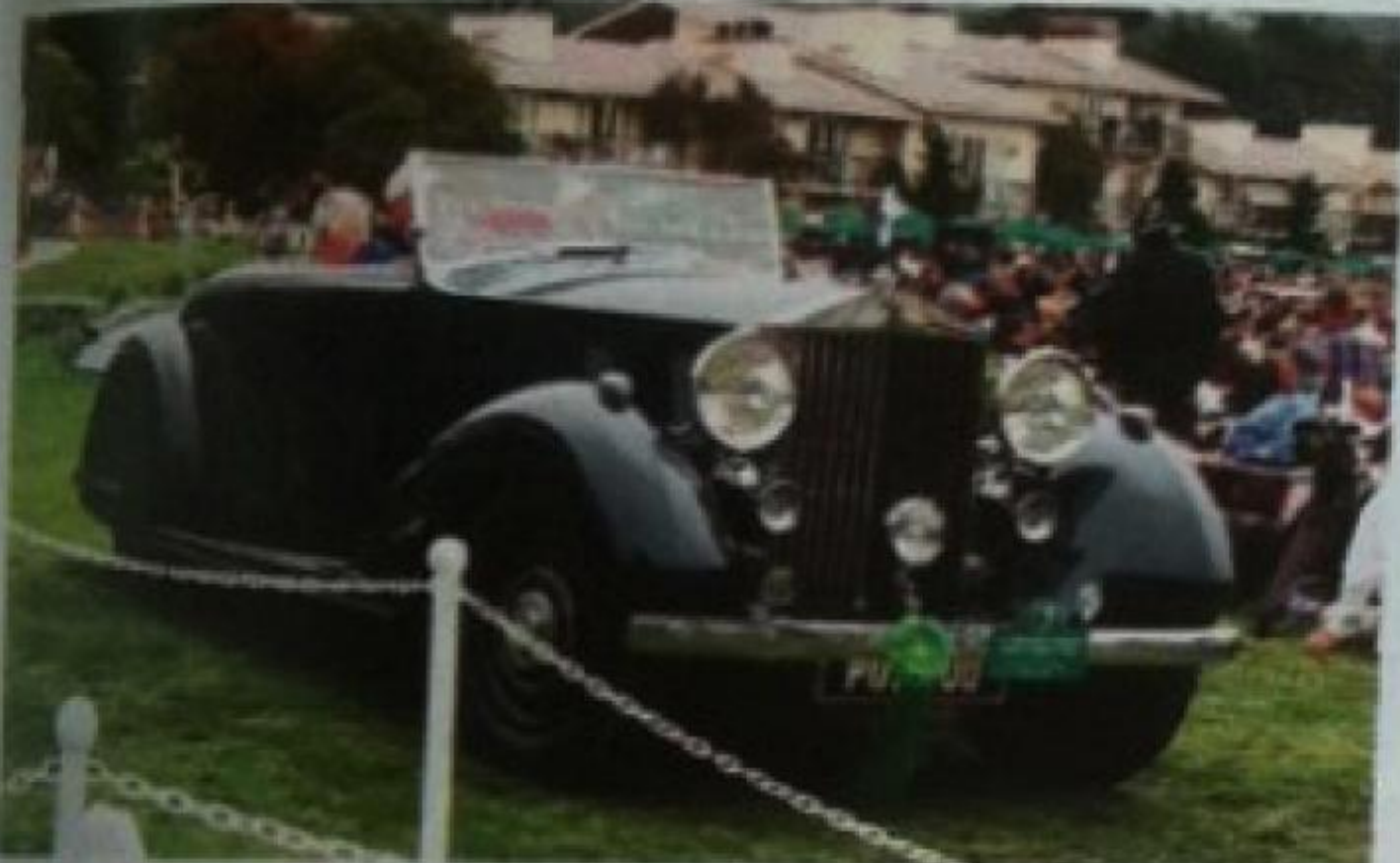
NIGHTY PHANTOM! There were no less than three Maharaja-owned Rolls-Royce Phantom IIIs at Pebble Beach. This is the ex-Maharaja of Rewa's 1937 Thrupp & Maberly bodied convertible.